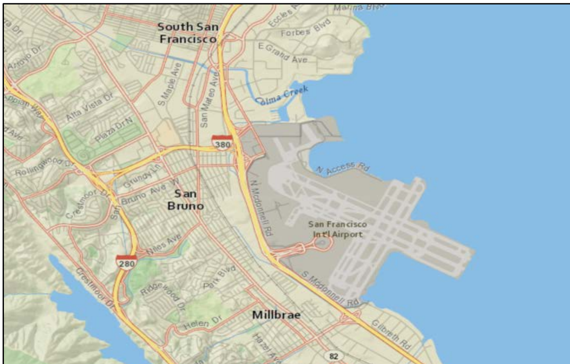
Figure 1. Airport Location Map