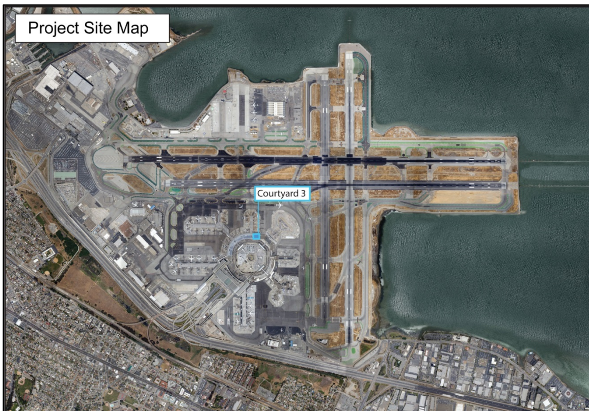
Figure 2. Project Site Location